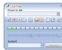
Zoiper softphone *Free